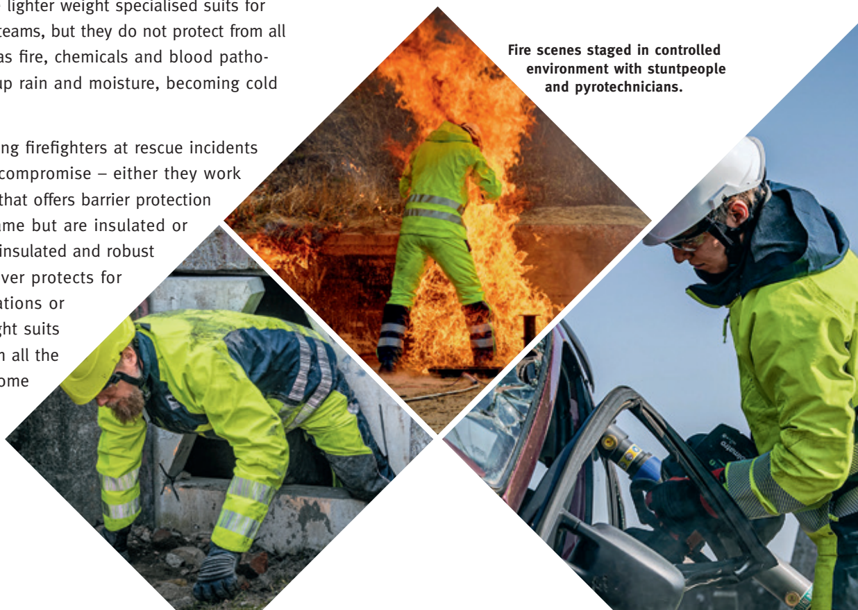
Fire scenes staged in controlled environment with stuntpeople and pyrotechnicians.

Firefighters cited comfort as their main requirement in rescue clothing, after meeting required protections levels defined by their risk assessment. Rescue incidents are often protracted and they need clothing that will protect them from the elements, keeping them dry and warm in the cold and rain, but also cool in the sun. They need a garment that is light and can move with them in confined and awkward spaces and it must offer protection from fire, chemicals and the risks associated with exposure to viruses, blood and body fluids. It also can be cleaned and decontaminated as often as needed.