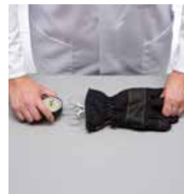
LINER RETENTION TEST