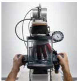
WHOLE GLOVE LEAK TEST

Our gloves are subject to a series of performance tests in our Gore labs to ensure they are “fitness for use”. To ensure the product meets our quality standards, products are produced in one of our partner’s certified factories.