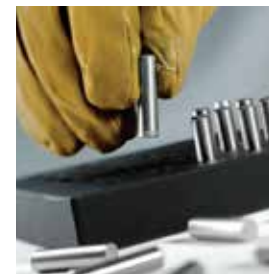
DEXTERITY AND GRIP TESTS: GORE-TEX Glove Inserts do not compromise dexterity

LAB TESTED FOR SUPERIOR PERFORMANCE WATERPROOF, WINDPROOF, VERY BREATHABLE