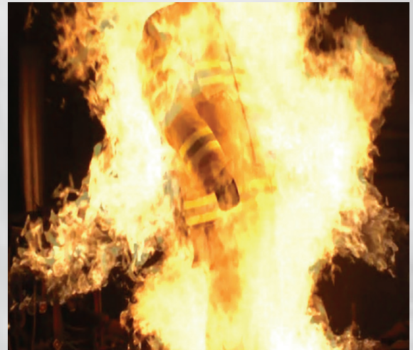
Pyroman, ASTM F1930-15 is an industry-recognized protocol for evaluating SYSTEM-LEVEL thermal performance in flashover-type conditions. Results are determined by material properties, any movement, and any shrinkage that occurs. 12-second exposure, used in the above testing, is considered a “severe” situation. Testing was performed at North Carolina State University’s Textile Protection and Comfort Center.

Gore’s products have provided proven, reliable, real world thermal protection for over 35 years.